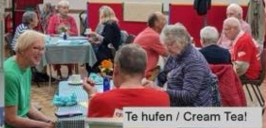
Te hufen / Cream Tea!