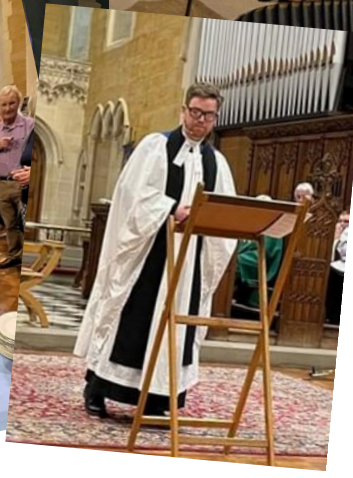
A Visual Snapshot of the Ministry Area