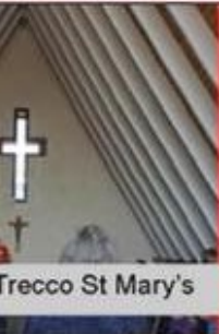
Trecco St Mary's