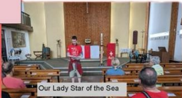
Our Lady Star of the Sea