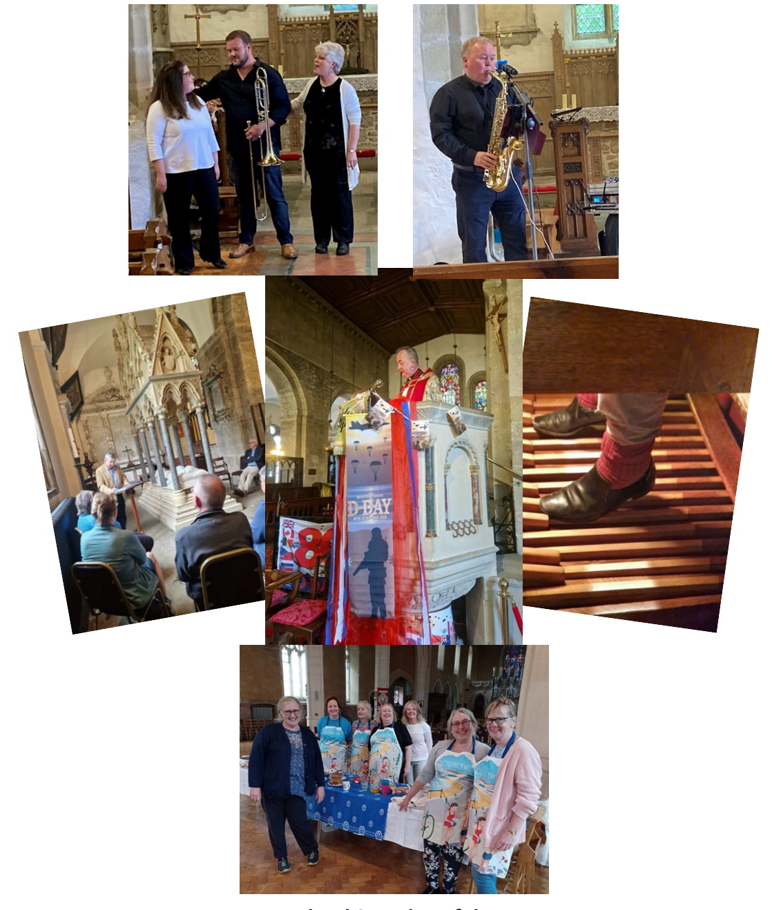
A Visual Snapshot of the Ministry Area